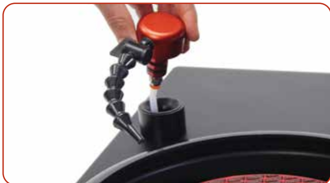
Retractable coolant nozzle allows quick and easy sample/bowl cleaning.