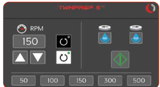
The 7" color LCD touchscreen is used to control all functions and is extremely easy to navigate, allowing greater efficiency among users.